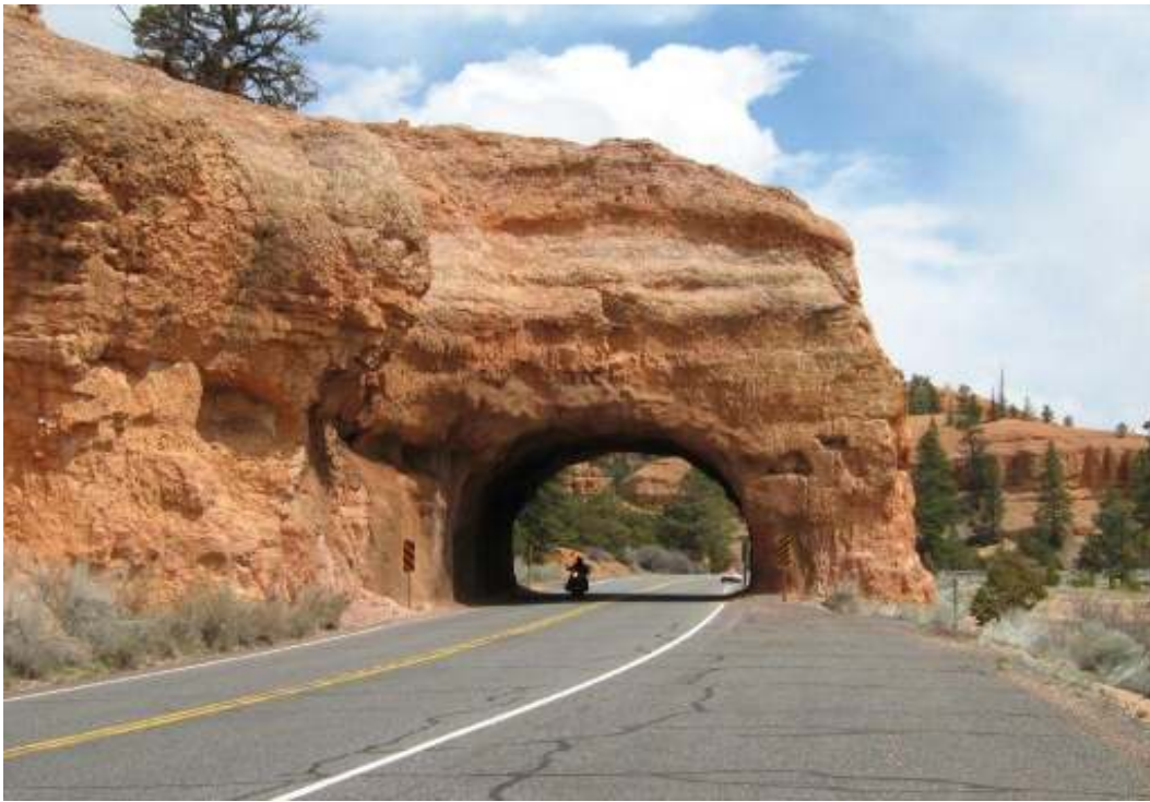
Who is going through the tunnel? Guess they all took their turn.